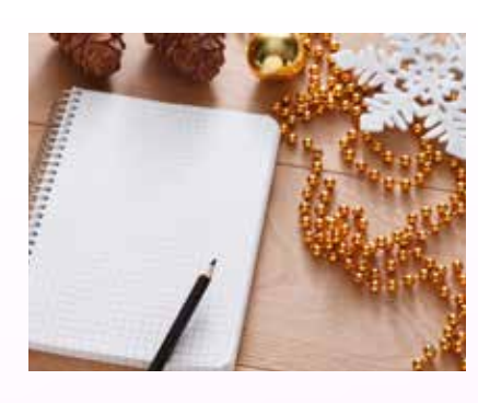
Fall is a Time to Take Stock, Let Go, Gather and Prepare

For the holidays, what's better than delicious and energizing bites? These dark chocolate coated bites will increase your energy levels and provide a good source of antioxidants. [...]