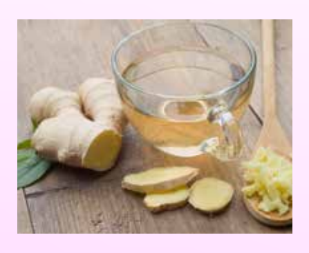
Ginger - Anti-Inflammatory and Analgesic in Dysmenorrhea

In the fall, we are naturally inclined to collect ourselves and to gather and prepare for the harsh winter months. The fall can also be a time to turn a little more inward to examine and let go of what no longer serves us before the cold weather sets in. [...]