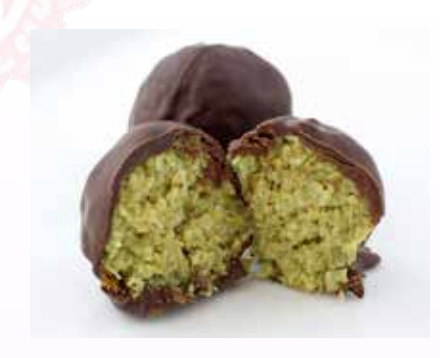
Mint and Matcha Green Tea Truffles

Vitamin E is abundant in both sebum, the substance that protects skin, and in skin cell membranes. Discover how supplementation with Vitamin E during harsh winter weather and contrasting dry interior environments can help preserve healthy youthful looking skin. [...]