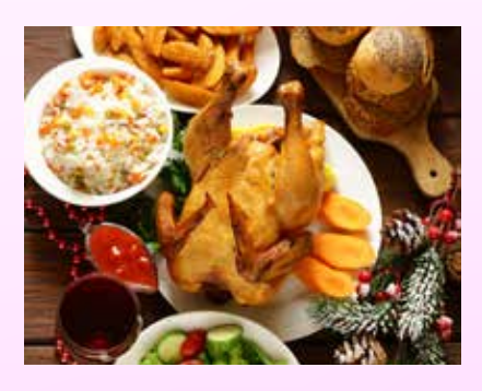
Feast on Your Holiday Favourites with Digestive Enzymes

There's so much hustle and bustle around the holiday period. I hope you get to spend some time slowing down and enjoying gatherings with family, friends, and good food. Here is a healthy holiday drink that is delicious and easy to prepare on top of being vegan, paleo, and gluten free. Wishing you all a wonderful Christmas! [...]