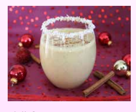
Chilled Turmeric Coconut Nog

Zingiber officinale, known commonly as ginger, has been widely recognized for its action as an antinausea remedy. However, traditional Chinese medicine has used ginger as an anti-inflammatory agent for musculoskeletal complaints for more than 2500 years. Ginger is classified as an herb of the [...]