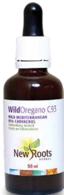
1233-1255-1476 Display boxes: 1267-1268

The correlation between the roles of oral bacteria in the formation of arterial plaque could present some additional therapeutic uses for oregano oil.