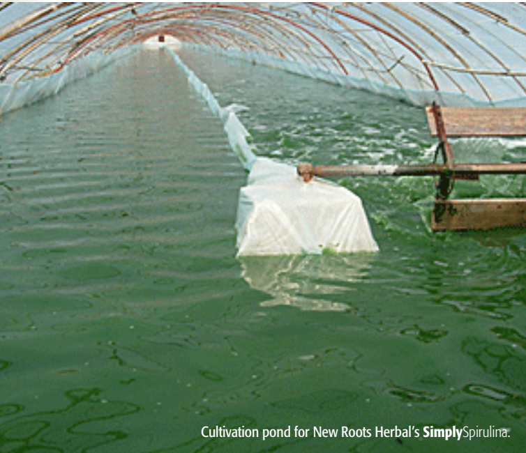
Cultivation pond for New Roots Herbal's SimplySpirulina .

SimplySpirulina and broken-wall Chlorella are now available exclusively as certified organic.