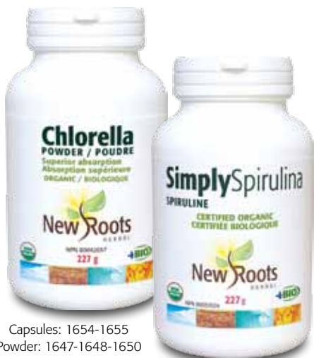
Capsules: 1654-1655 Powder: 1647-1648-1650